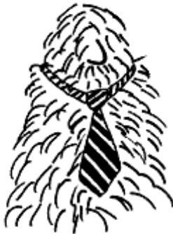
HIRSUITE AND TIE